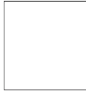
Right index fingerprint of alien removed

(Signature of alien being fingerprinted)